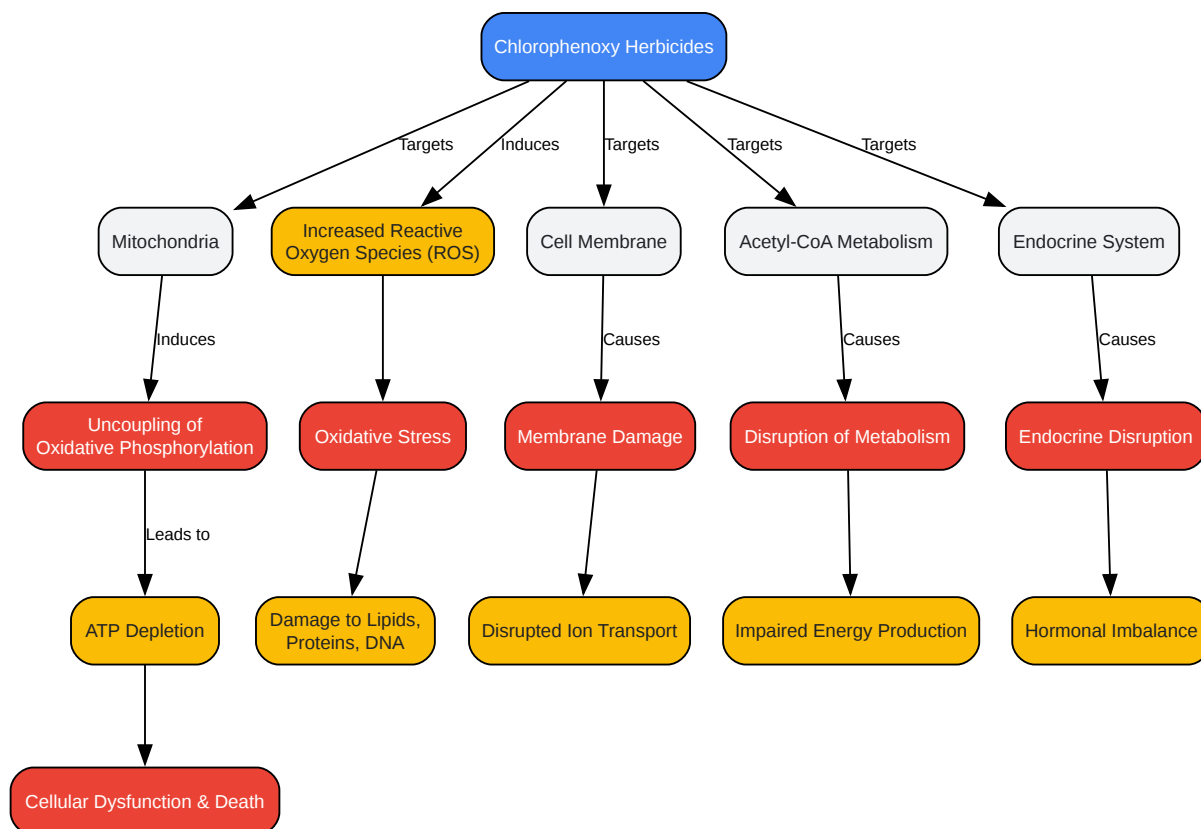
Figure 1: Core Toxicological Mechanisms of Chlorophenoxy Herbicides

Click to download full resolution via product page