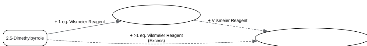
Diagram 2: Mono- vs. Di-formylation

Click to download full resolution via product page