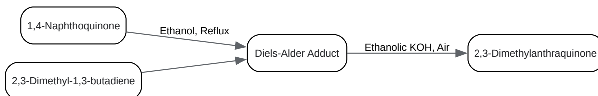
Diagram of the Synthesis of 2,3-Dimethylantraquinone

Click to download full resolution via product page