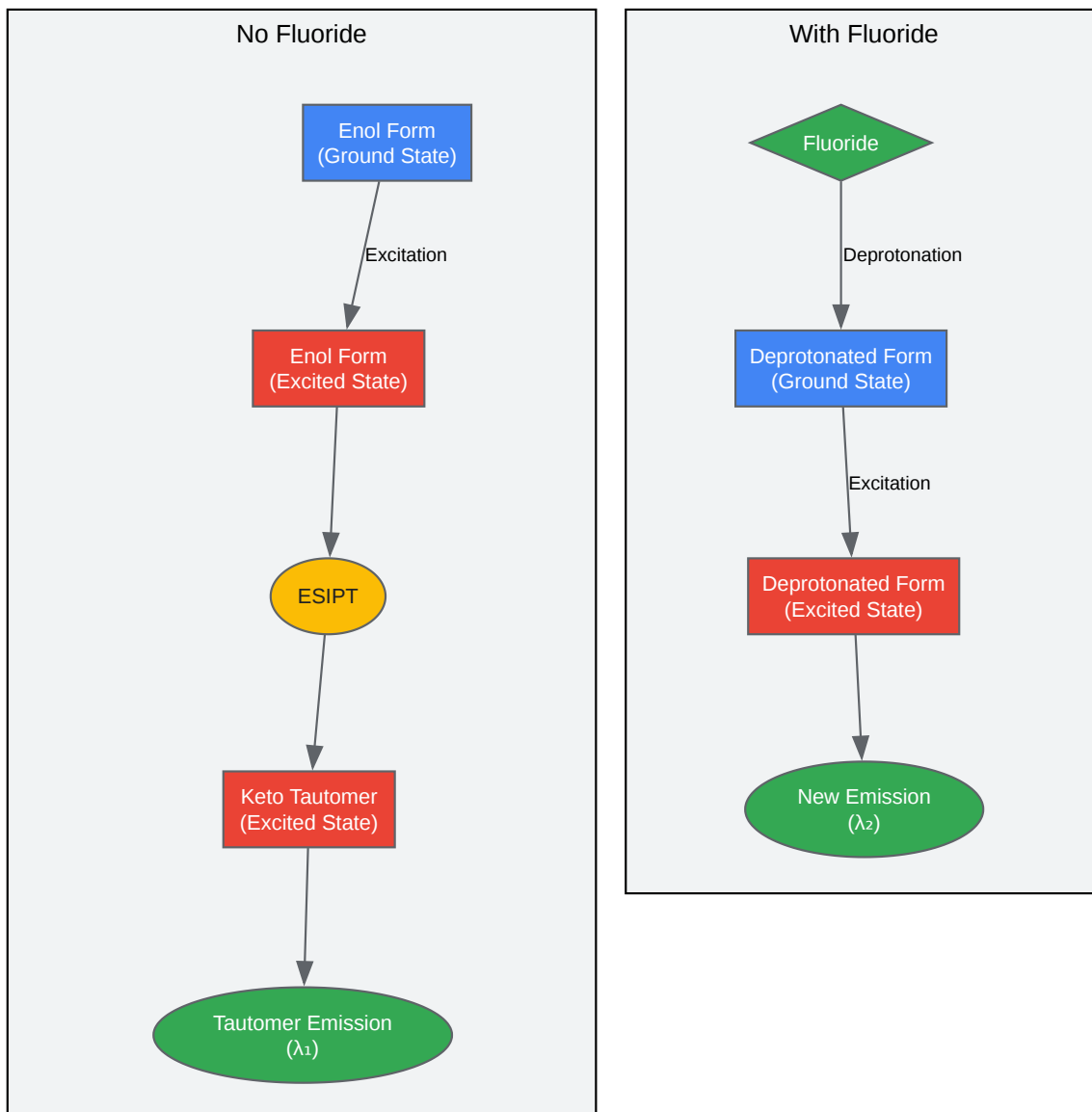
Mechanism of an ESIPT-Based Ratiometric Fluoride Probe

Click to download full resolution via product page