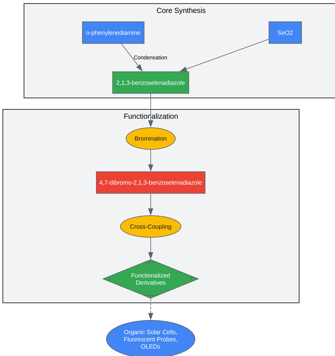
General Synthetic Workflow for Functionalized Benzoselenadiazoles

Click to download full resolution via product page