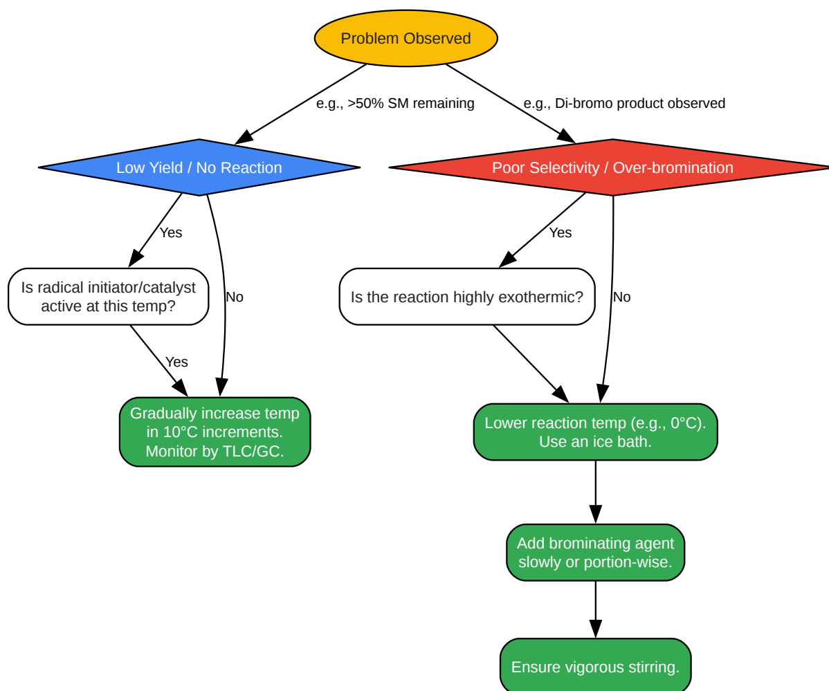
Figure 2: Troubleshooting Flowchart for Bromination

Click to download full resolution via product page