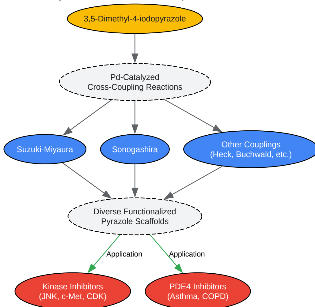
Figure 2: Role as a Versatile Synthetic Intermediate

Click to download full resolution via product page