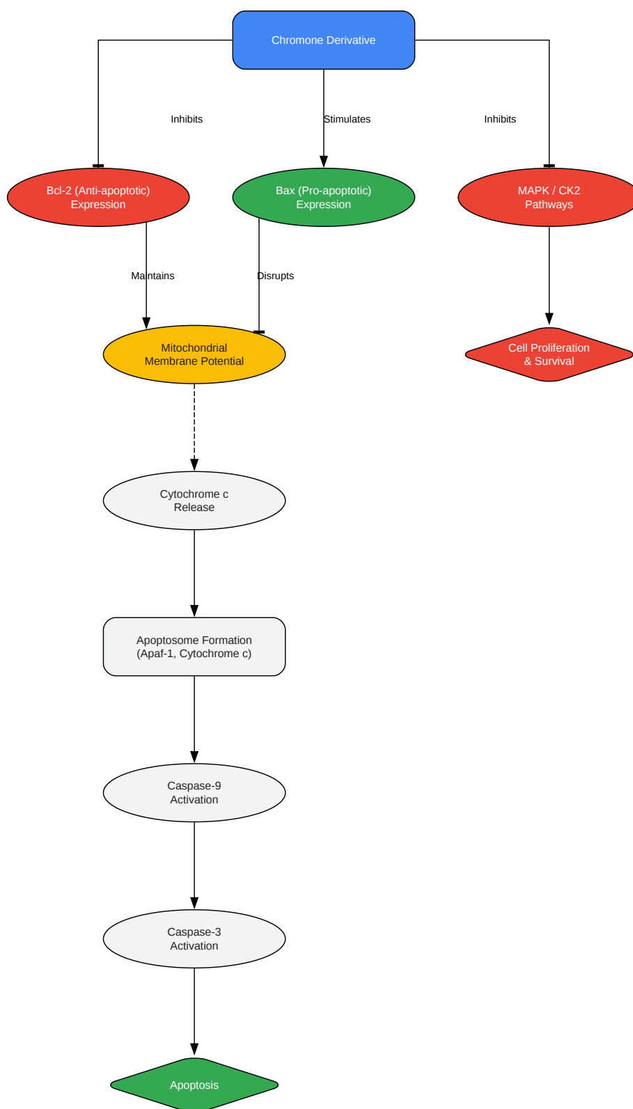
Figure 1: Anticancer Mechanism of Chromone Derivatives

Click to download full resolution via product page