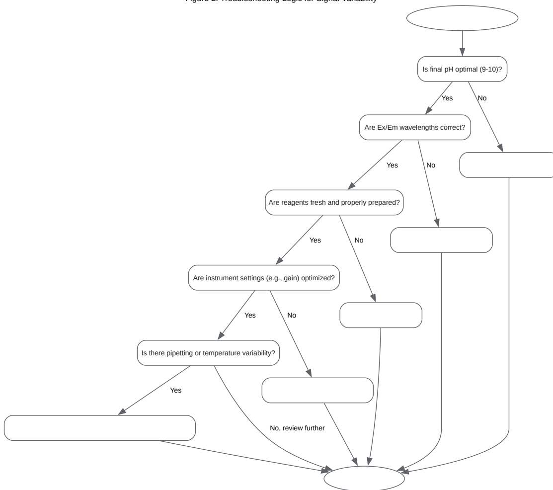
Figure 2. Troubleshooting Logic for Signal Variability

Click to download full resolution via product page