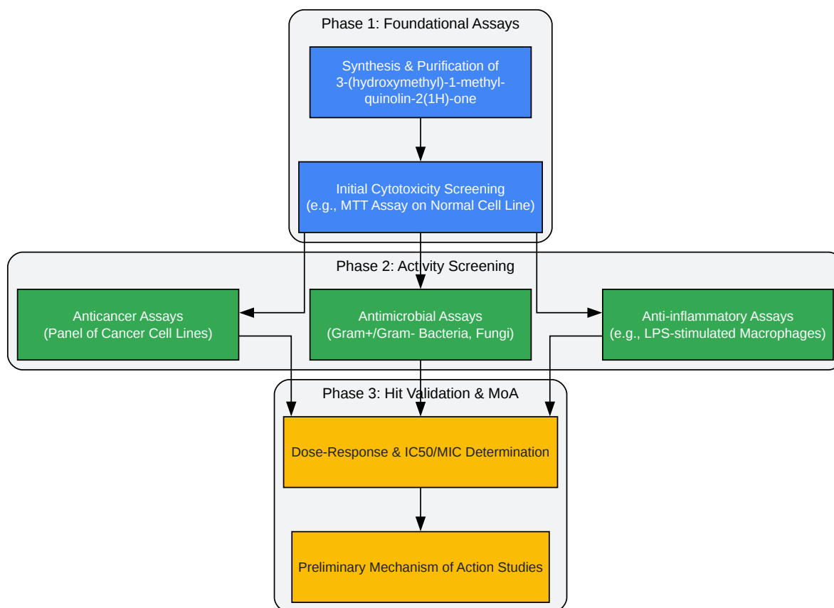
Figure 1. Preliminary Screening Workflow

Click to download full resolution via product page