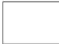
Dibenzyl Sulfoxide C_{14}H_{14}OS