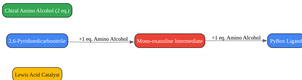
Diagram: Reaction Pathway to PyBox and the Mono-Oxazoline Side Product

Click to download full resolution via product page