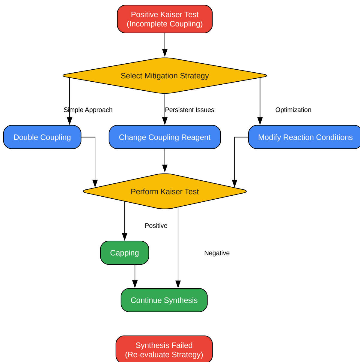
Diagram: Troubleshooting Workflow for Incomplete Coupling

Problem: A positive Kaiser test is observed after the coupling step of 1-(Cbz-amino)cyclohexanecarboxylic acid .