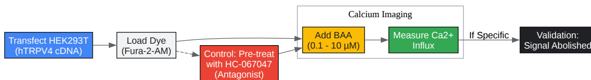
Diagram 2: Experimental Workflow (TRPV4 Validation)

Click to download full resolution via product page