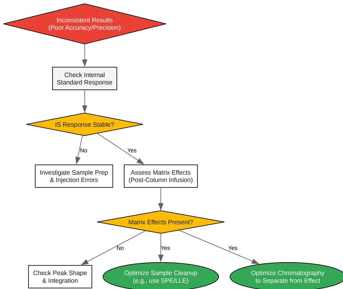
Diagram: Troubleshooting Logic for Inconsistent Results

Click to download full resolution via product page