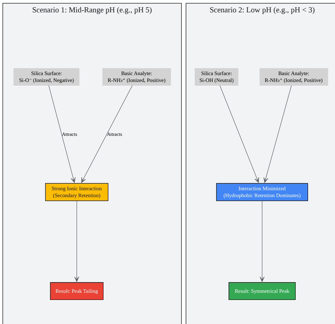
Mechanism of Peak Tailing via Silanol Interaction

Caption: A workflow diagram for diagnosing and resolving common peak shape issues in HPLC.