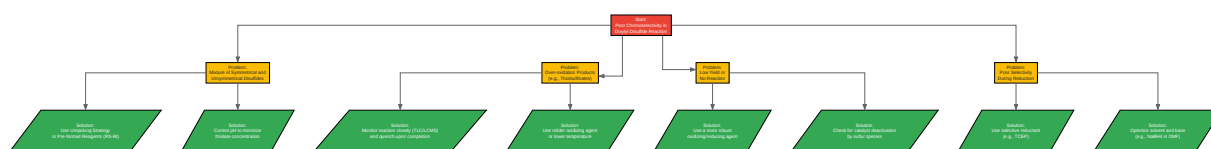
Diagram 1: Troubleshooting Workflow for Poor Chemoselectivity

Click to download full resolution via product page