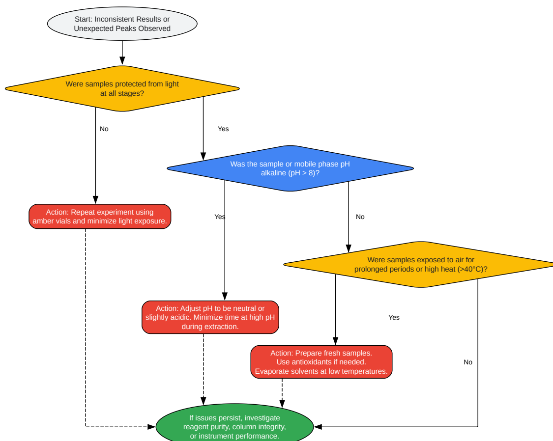
Fig. 3: Troubleshooting Flowchart for Degradation Issues

Use this flowchart to diagnose potential sources of Levosulpiride degradation during your experiments.