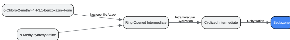
Reaction Mechanism for Seclazone Synthesis

Click to download full resolution via product page