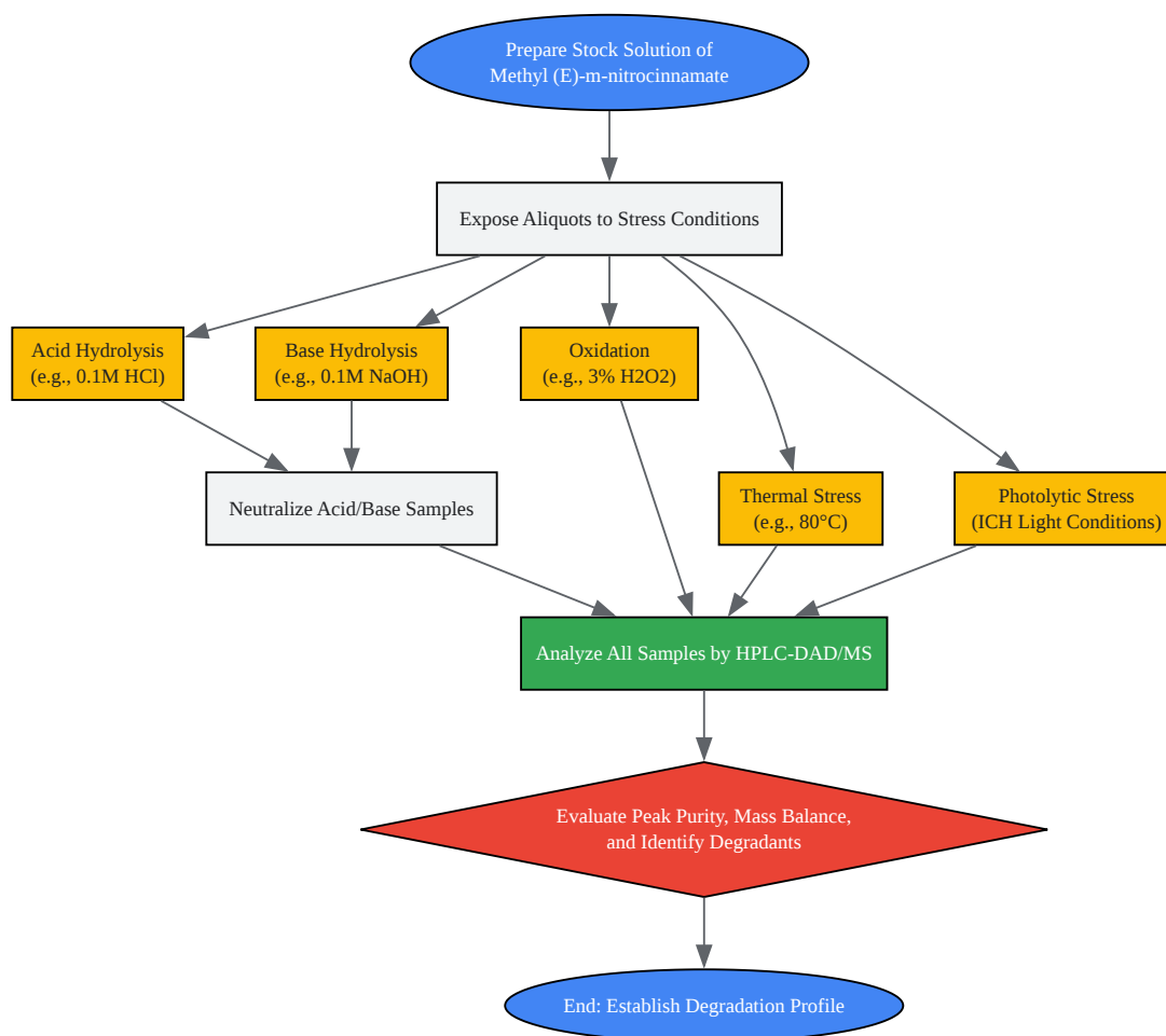
Workflow for Forced Degradation Study

Click to download full resolution via product page