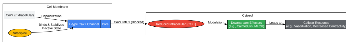
Diagram of Nifedipine's Core Mechanism:

Click to download full resolution via product page