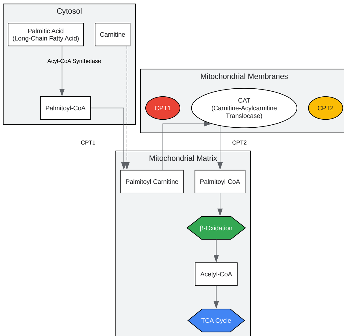
Role of Palmitoyl Carnitine in Mitochondrial Fatty Acid \beta -Oxidation

Click to download full resolution via product page