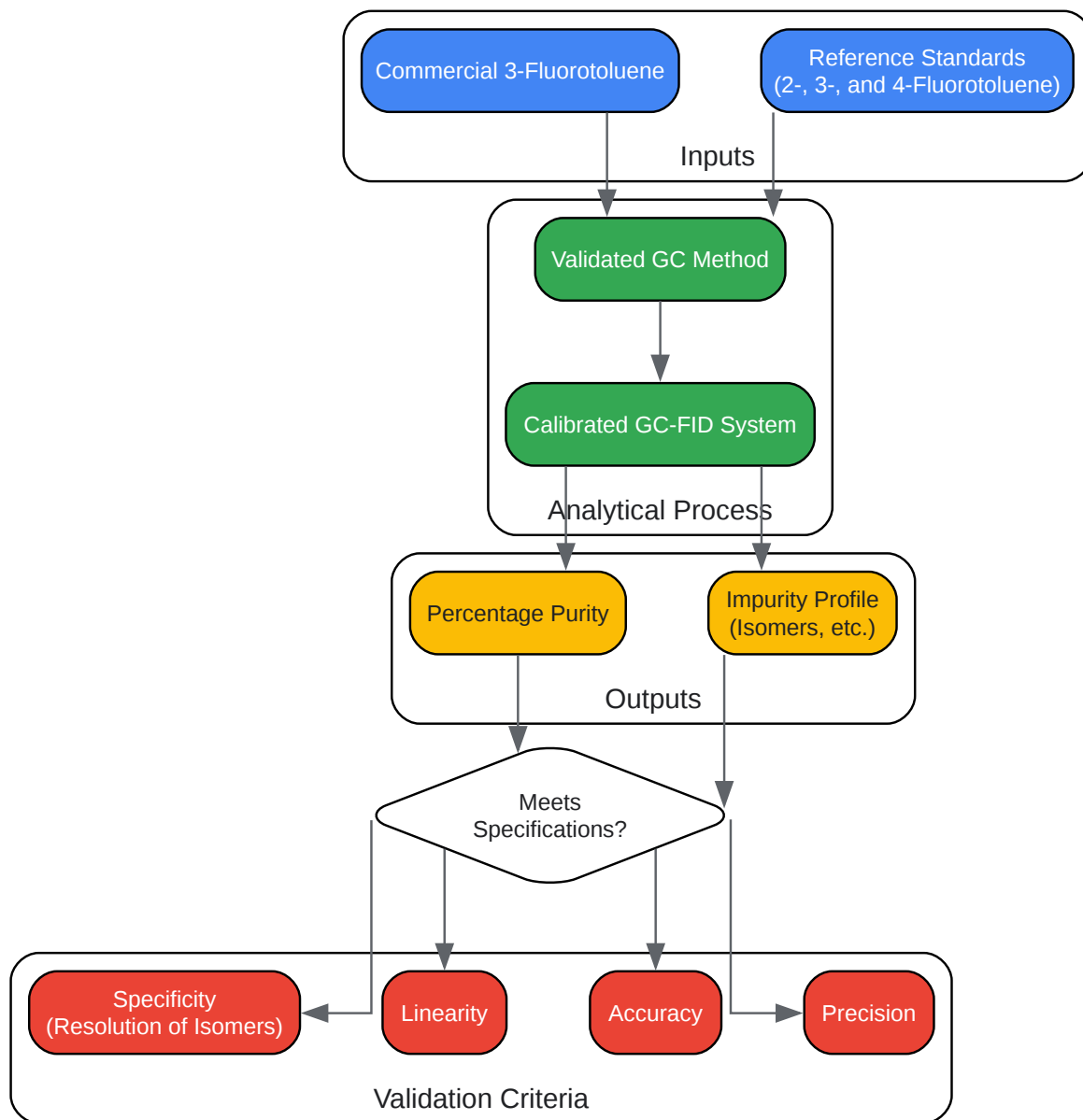
Figure 2: Logical Framework for Purity Validation of 3-Fluorotoluene

Click to download full resolution via product page