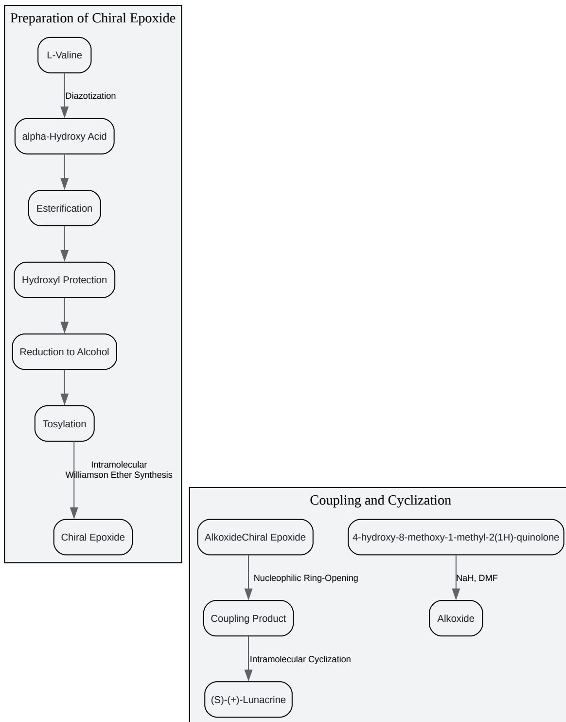
Diagram 1: Enantioselective Synthesis Workflow

Click to download full resolution via product page