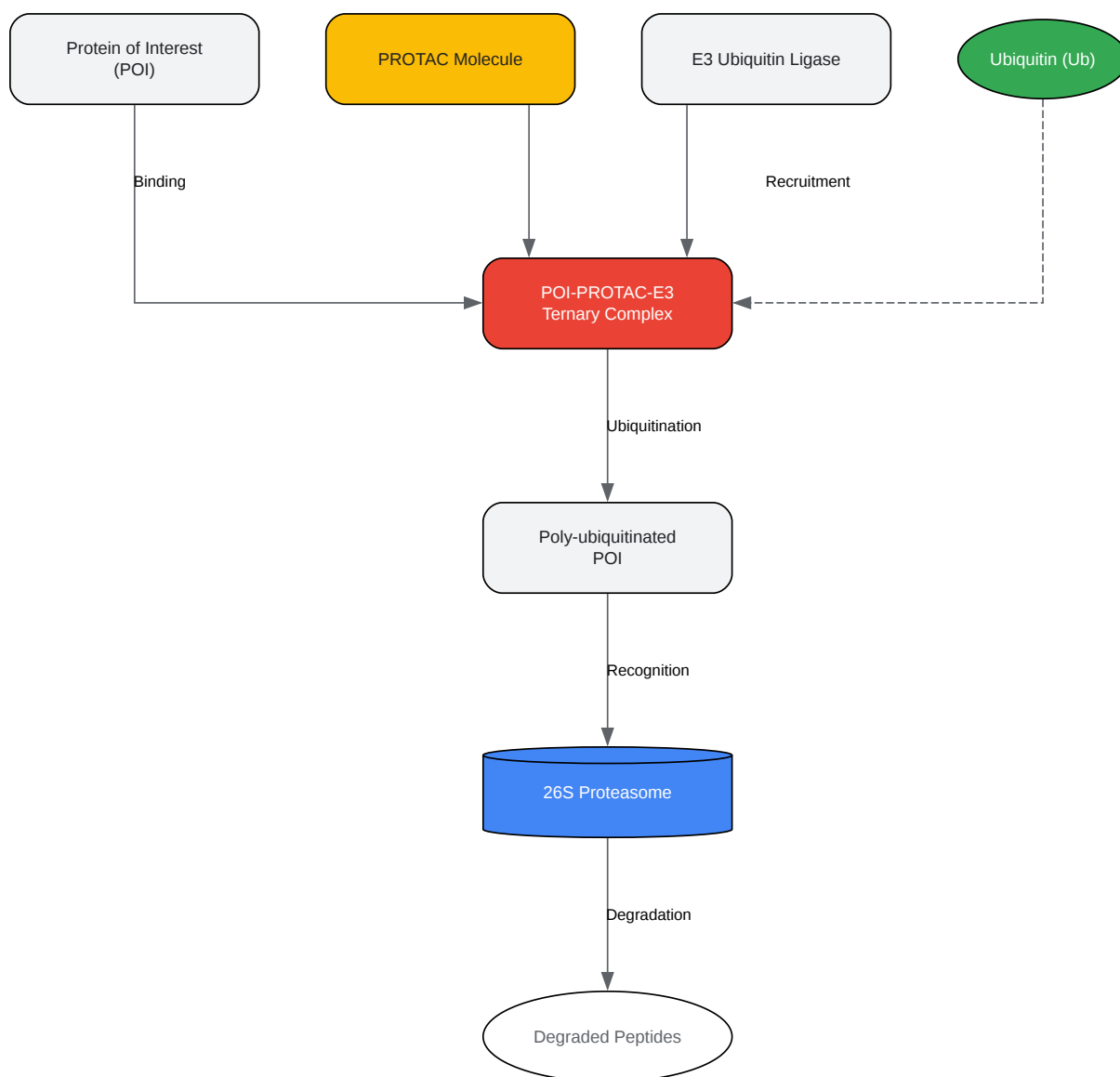
Figure 1: General Mechanism of PROTAC Action

Click to download full resolution via product page