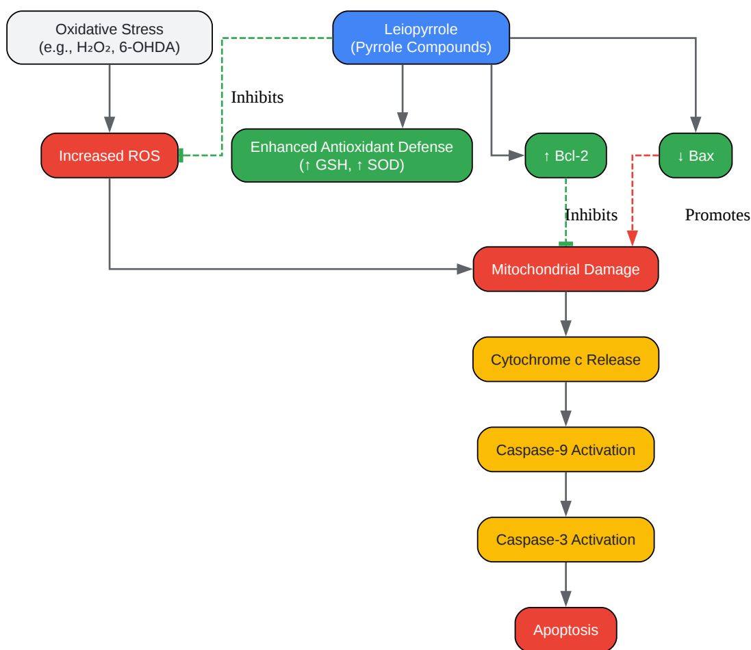
Oxidative Stress and Apoptosis Pathway

Click to download full resolution via product page