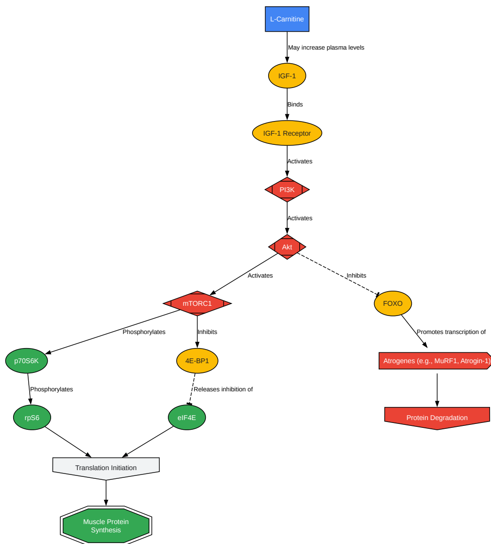
Figure 1: Proposed mechanism of LCLT-mediated enhancement of androgen signaling.

Click to download full resolution via product page