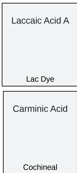
Figure 1: Chemical Structures of Primary Colorants

Click to download full resolution via product page