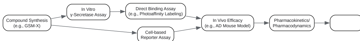
Diagram 2: Experimental Workflow for GSM Characterization

Click to download full resolution via product page