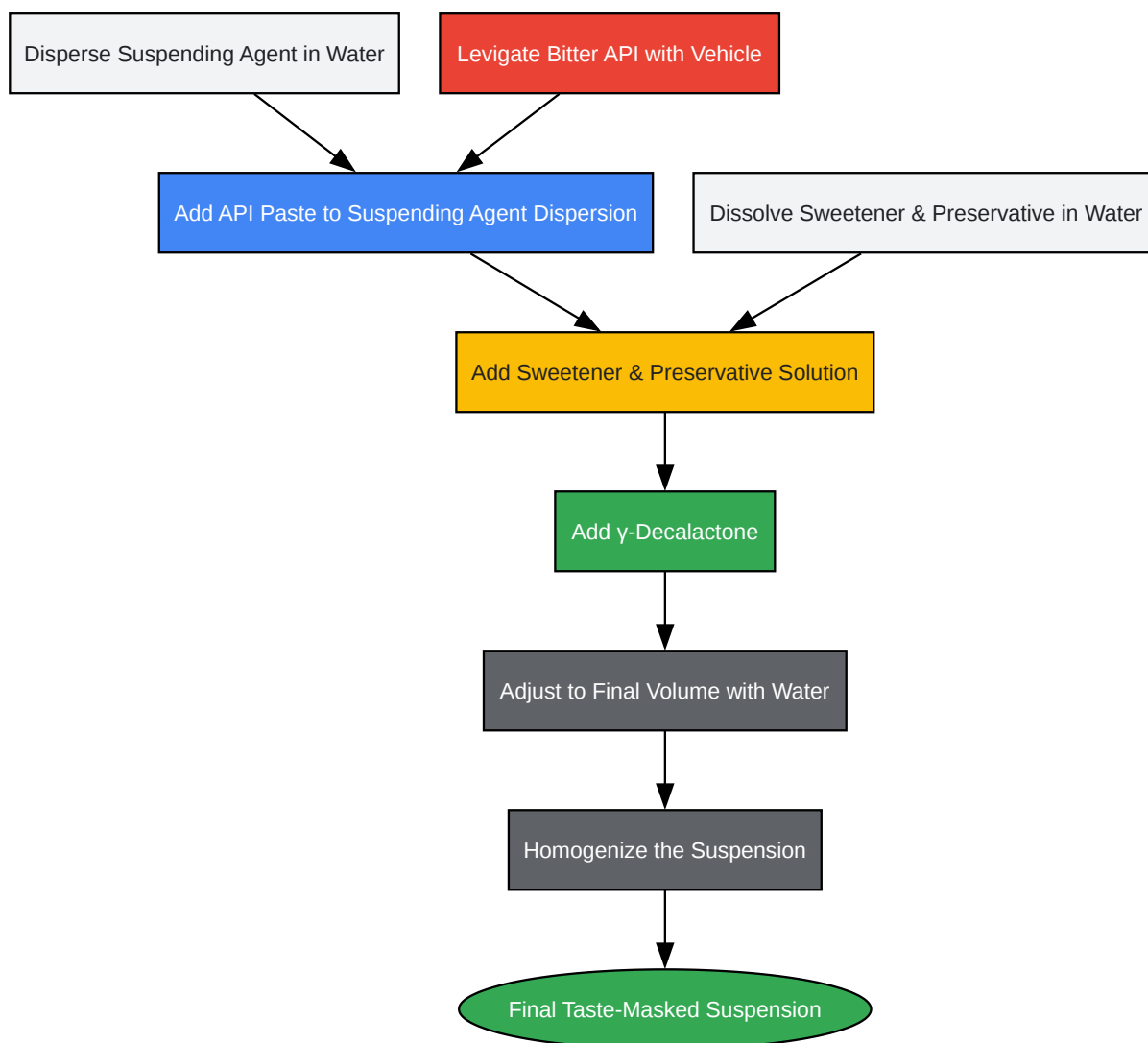
Figure 2: Workflow for Liquid Suspension Formulation