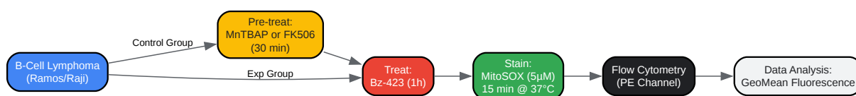
Figure 2: Experimental Workflow & Decision Tree

Click to download full resolution via product page