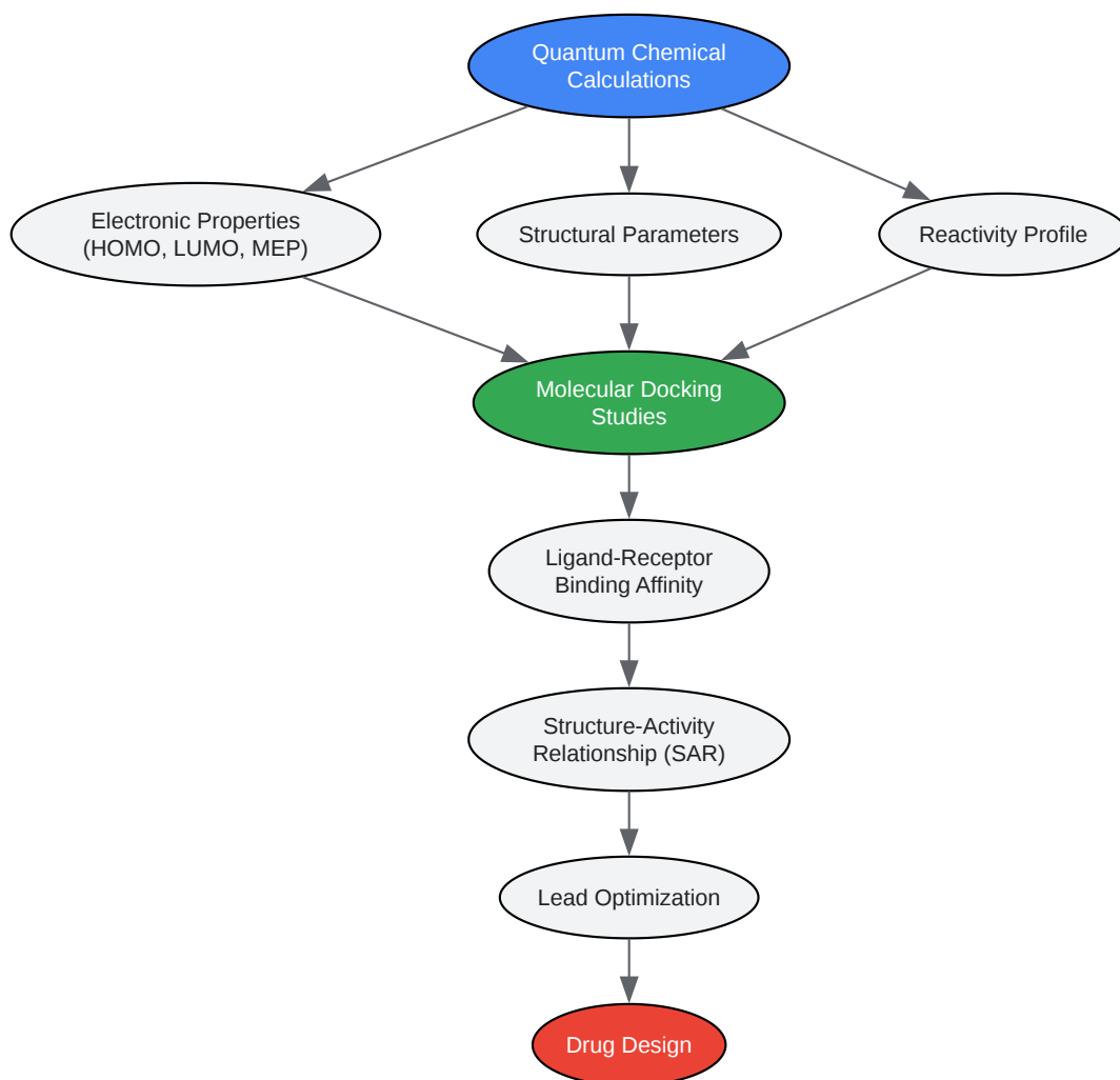
Figure 2: Role of Quantum Calculations in Drug Development

Click to download full resolution via product page