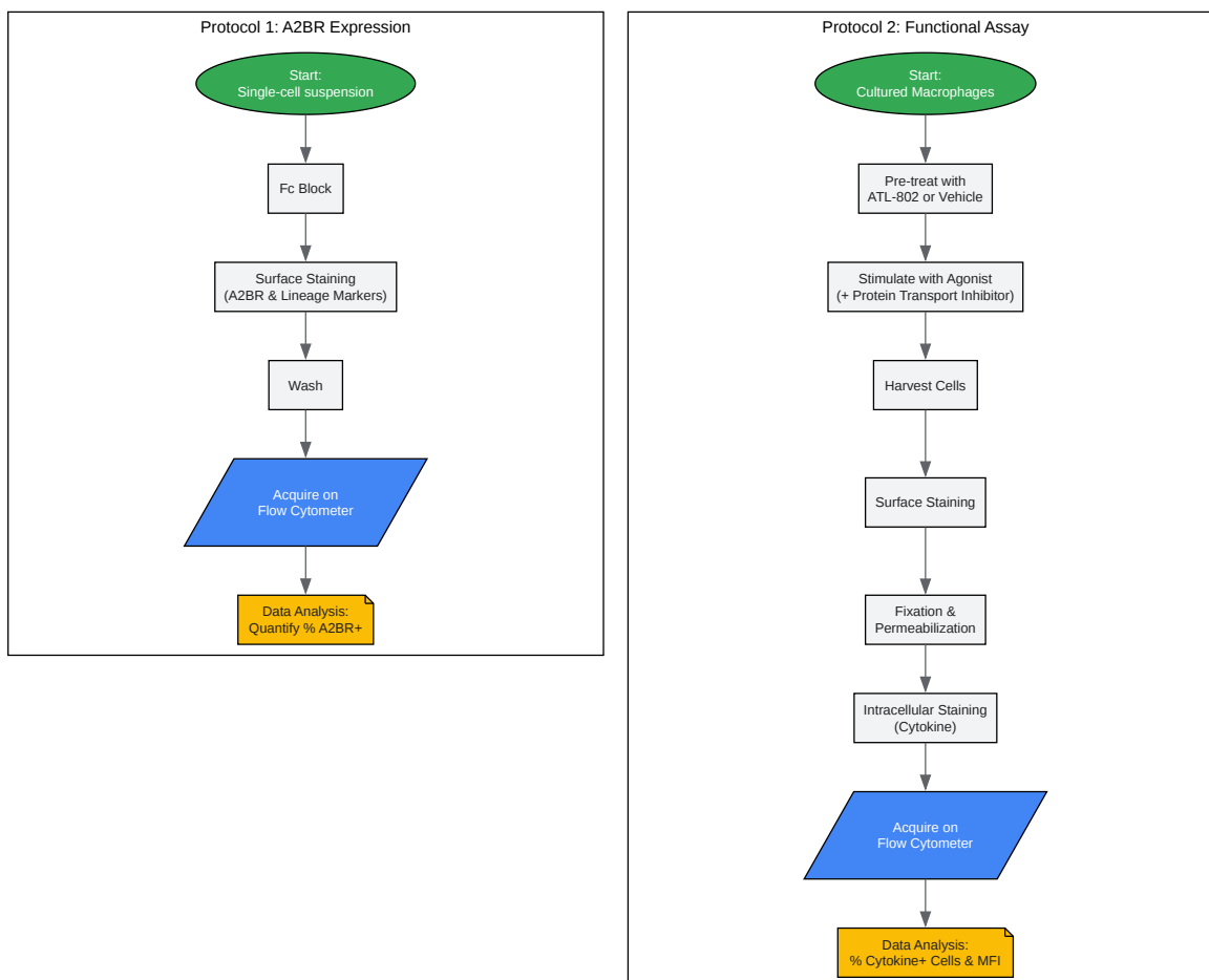
Flow Cytometry Experimental Workflow for ATL-802

Click to download full resolution via product page