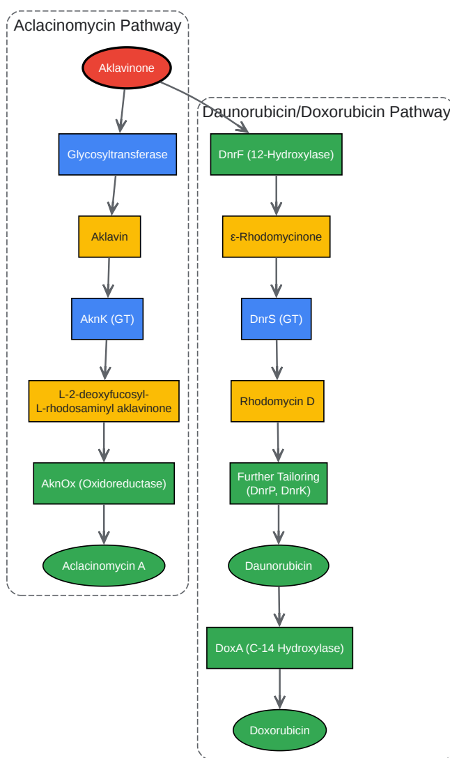
Post-Aklavinone Tailoring Pathways