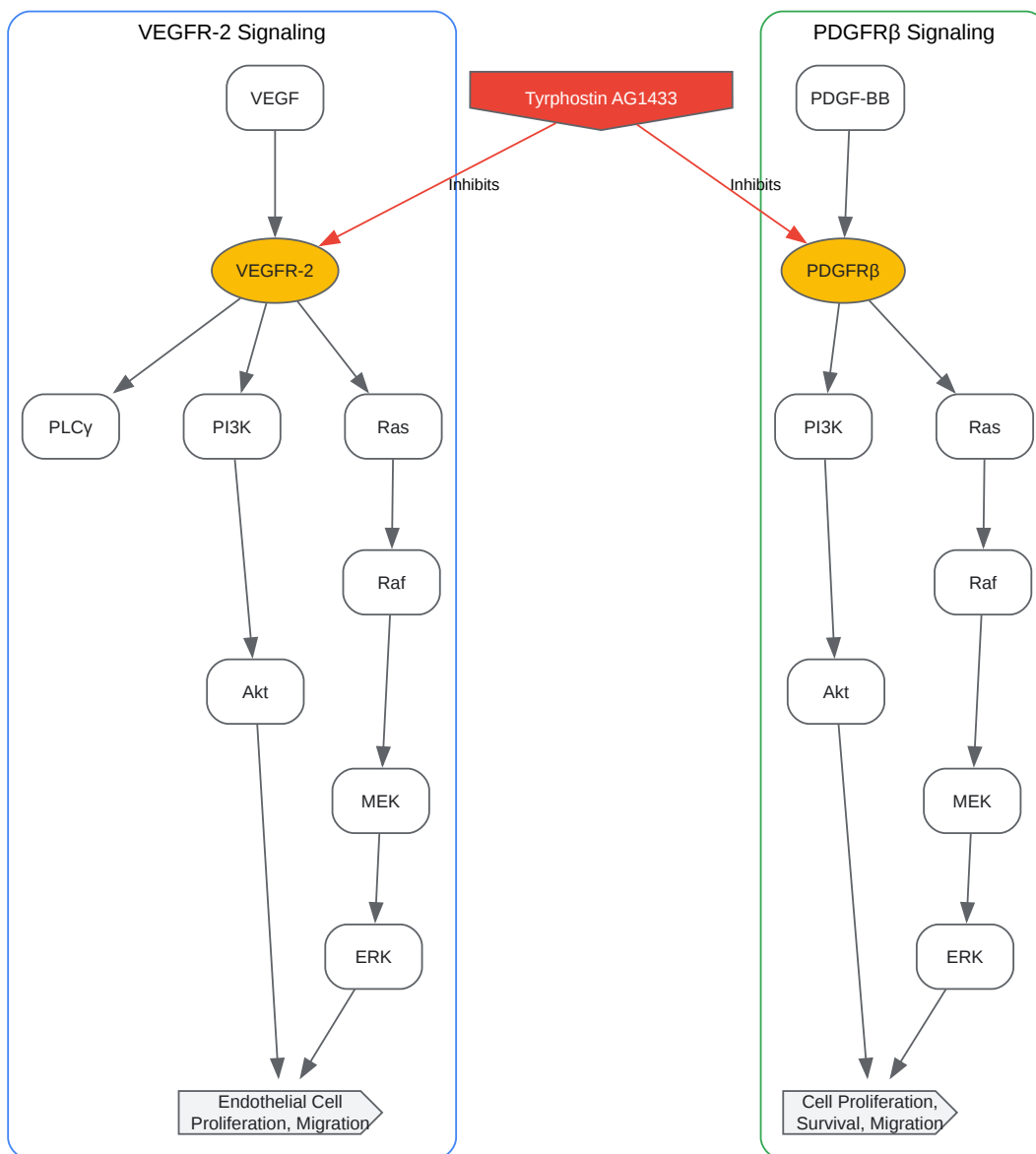
Simplified VEGFR-2 and PDGFR \beta Signaling Pathways