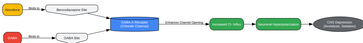
Figure 4: Proposed Signaling Pathway of Alozafone

Click to download full resolution via product page