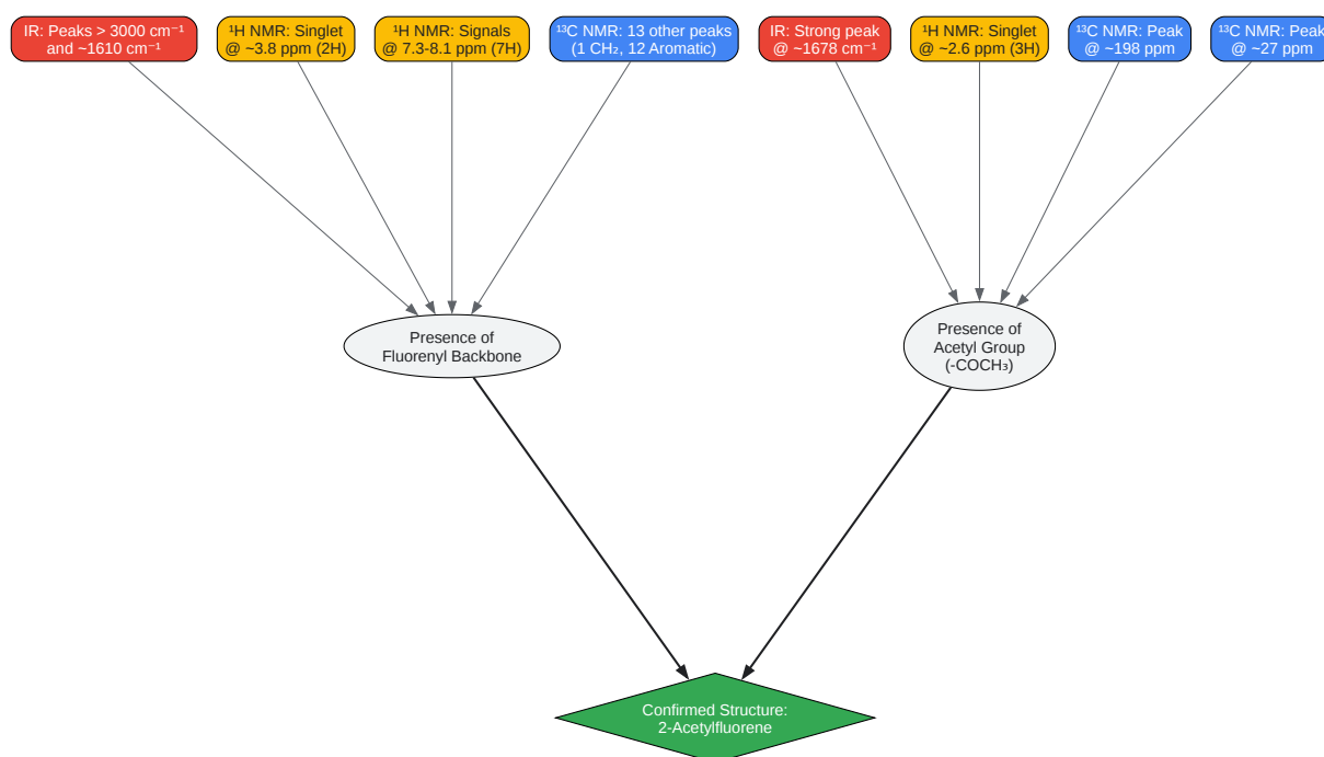
Figure 3: Logical Confirmation of 2-Acetylfluorene Structure

Click to download full resolution via product page