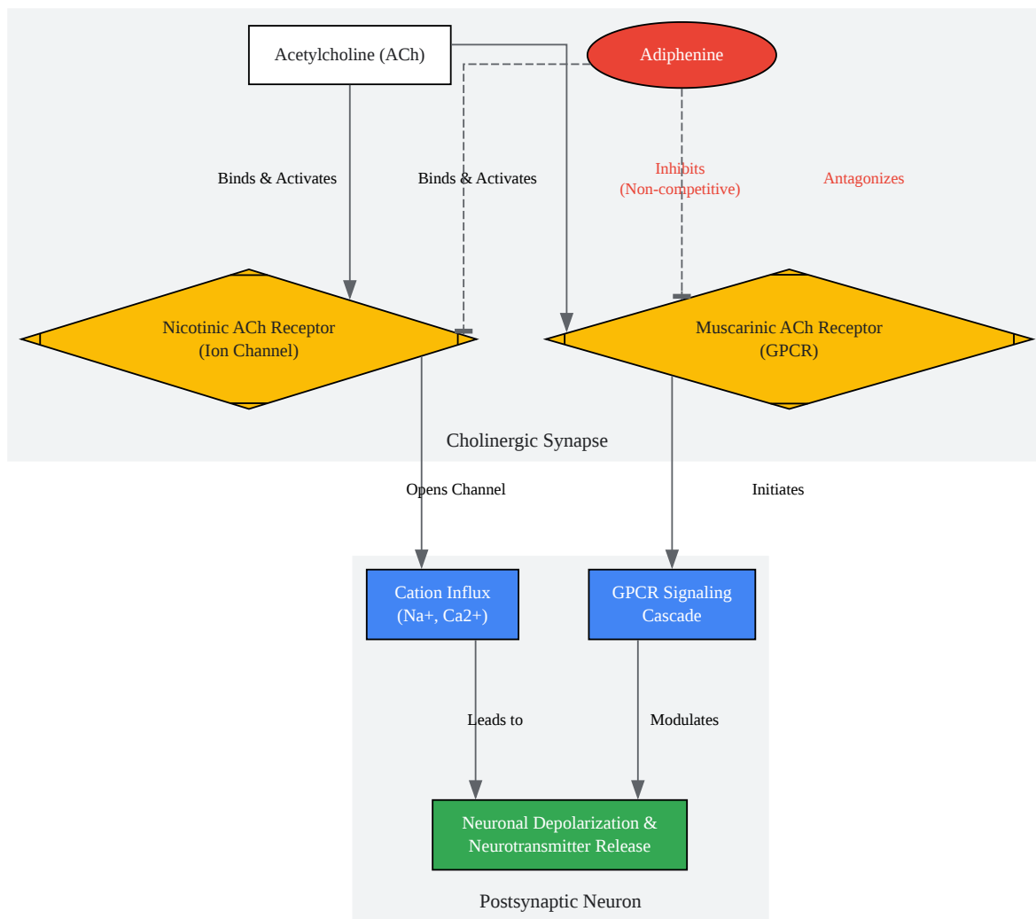
Figure 1: Adiphenine's Mechanism of Action

Click to download full resolution via product page