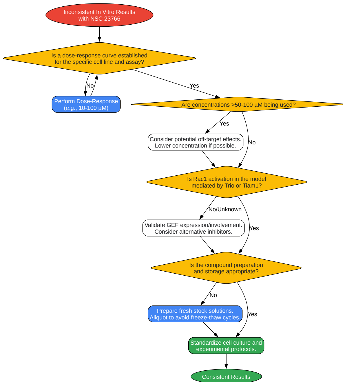
Caption: Mechanism of Action of NSC 23766.

Click to download full resolution via product page