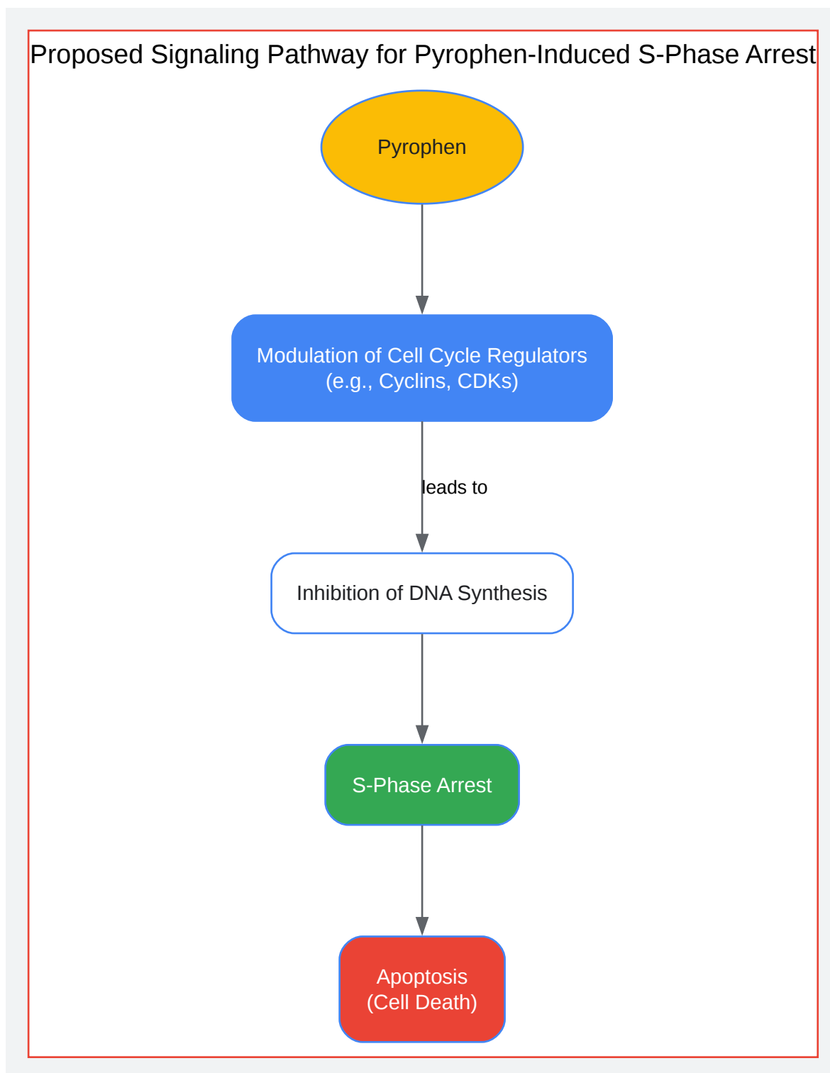
Figure 1. Experimental workflow for determining the cytotoxicity of Pyrophen using the MTT assay.

Click to download full resolution via product page