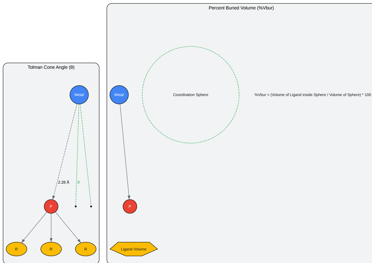
Fig. 1: Conceptual Comparison of Steric Parameters

Click to download full resolution via product page