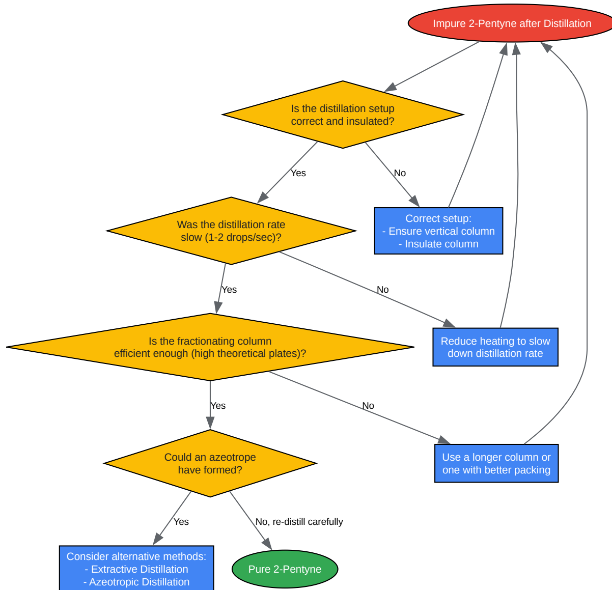
Diagram 1: Troubleshooting Impure Distillate

Click to download full resolution via product page