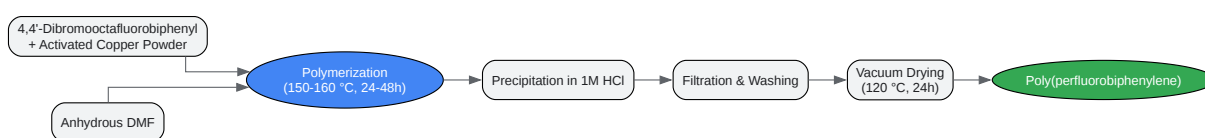
Diagram of Ullmann Coupling Polymerization Workflow:

Click to download full resolution via product page