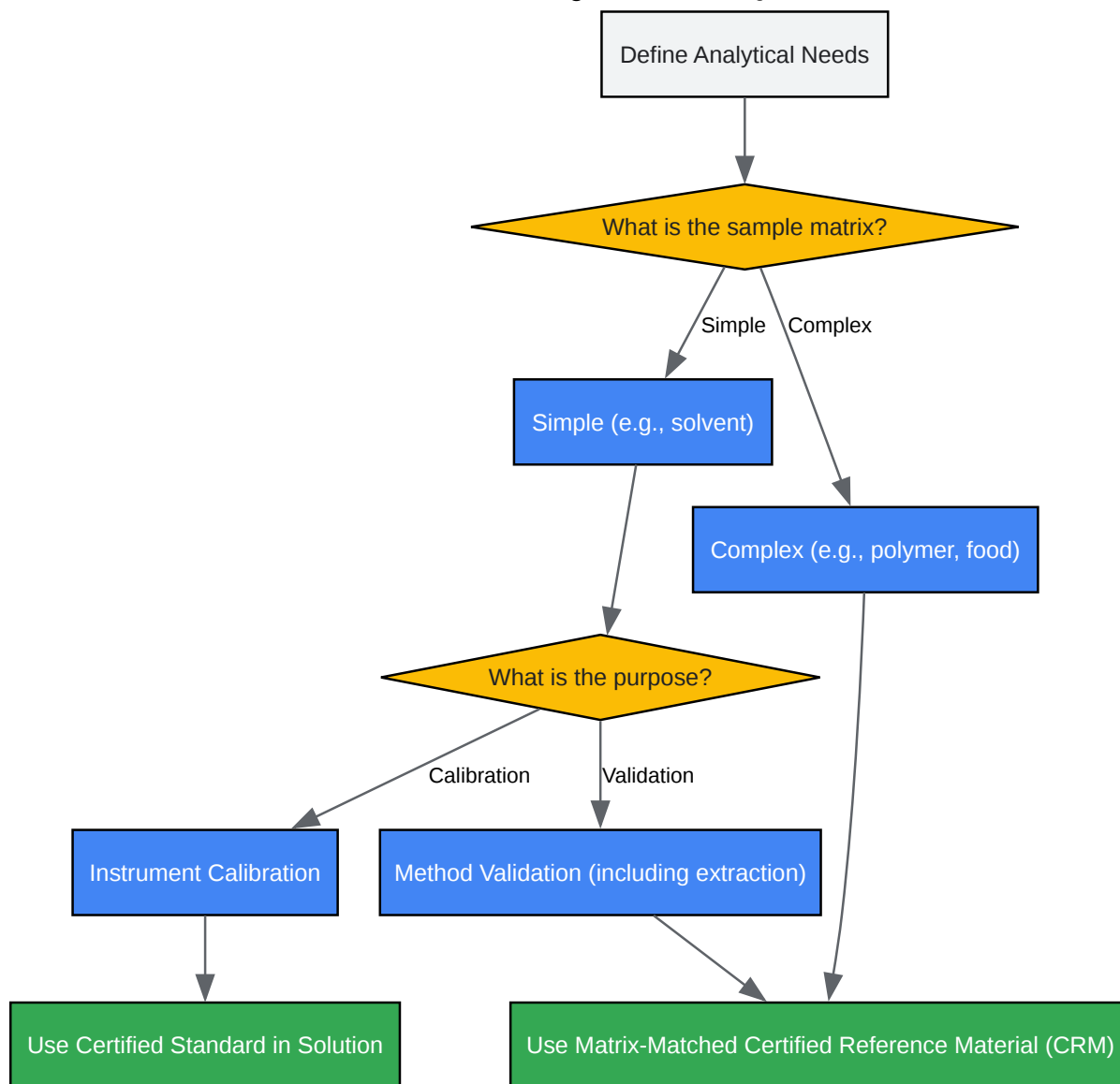
Decision Tree for Selecting a Phthalate QC Material

Click to download full resolution via product page