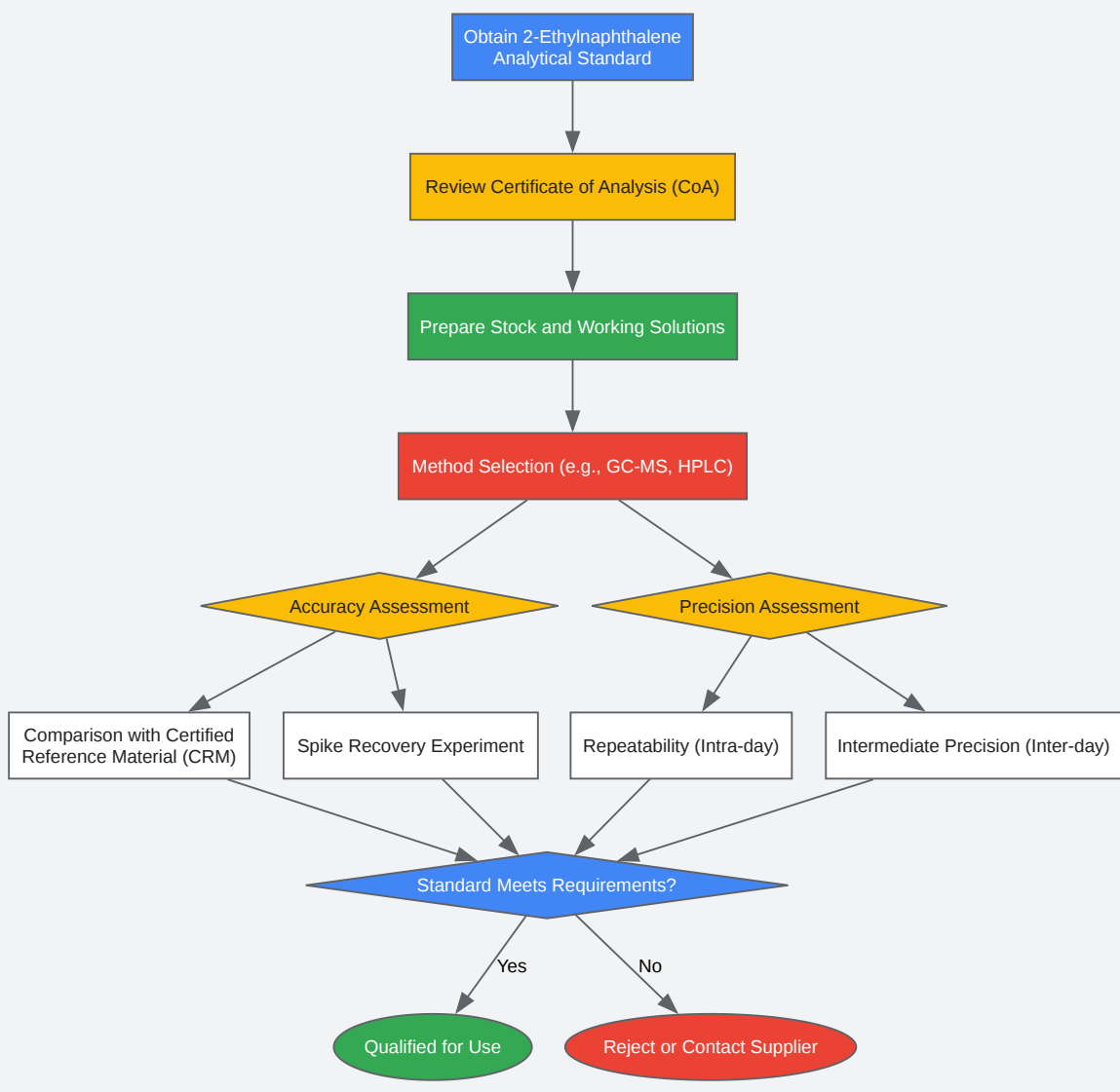
Standard Evaluation Workflow