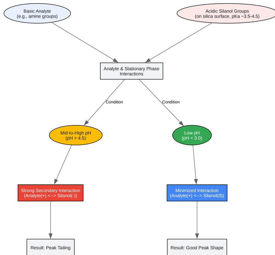
Logic for Mobile Phase pH Selection

Click to download full resolution via product page