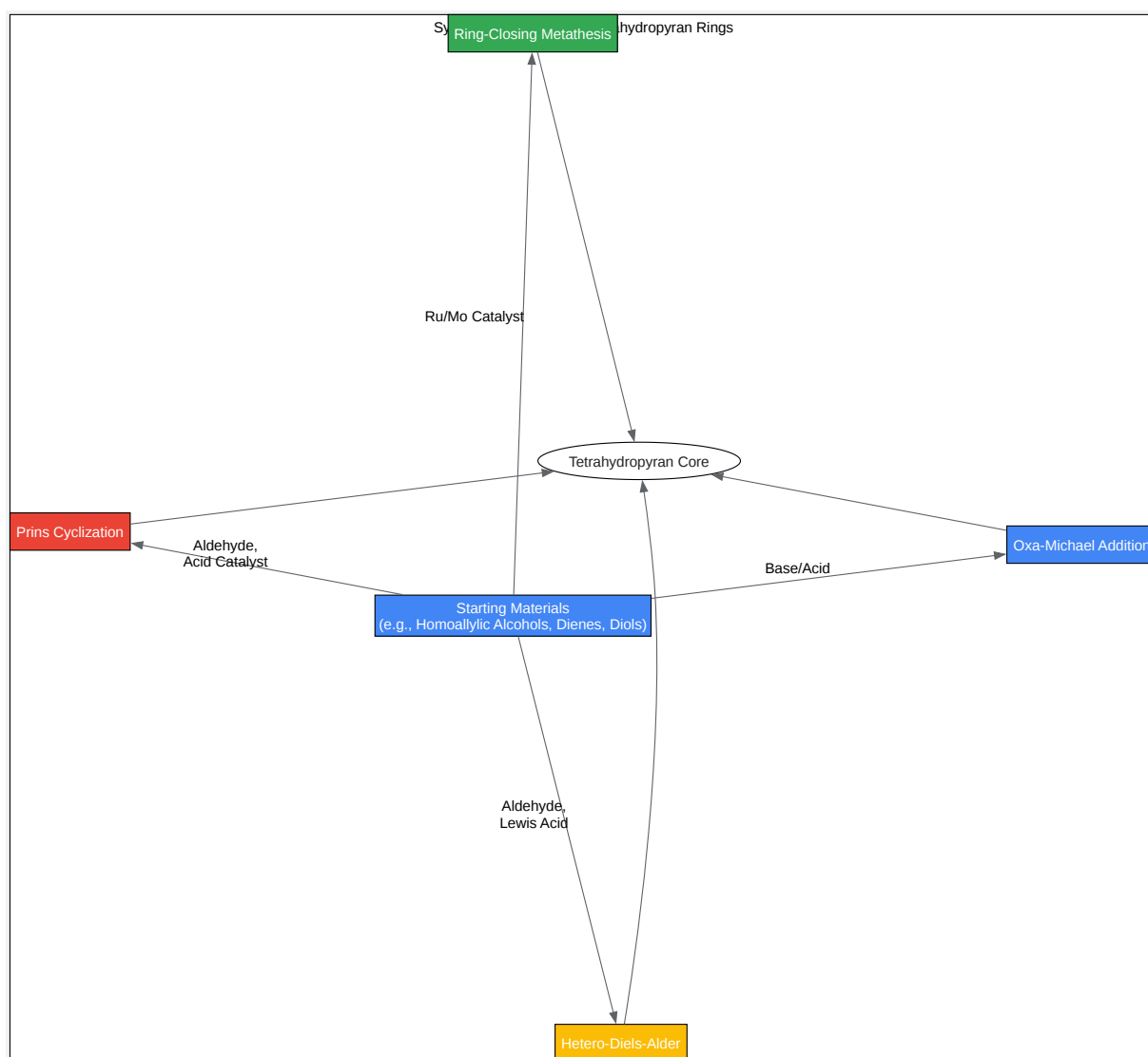
Diagram: Key Synthetic Strategies for THP Ring Formation