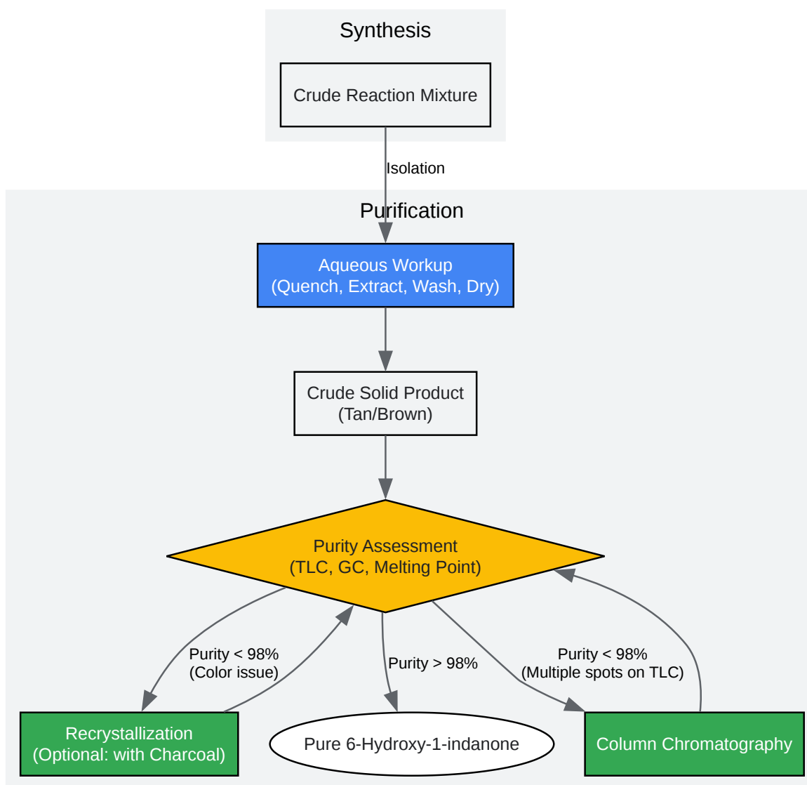
General Purification Workflow for 6-Hydroxy-1-indanone

Click to download full resolution via product page