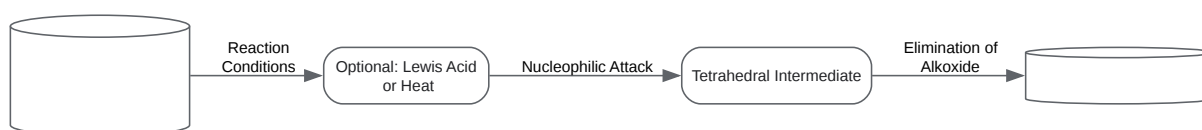
Fig. 2: Amidation of Thiazole-4-carboxylates

Click to download full resolution via product page