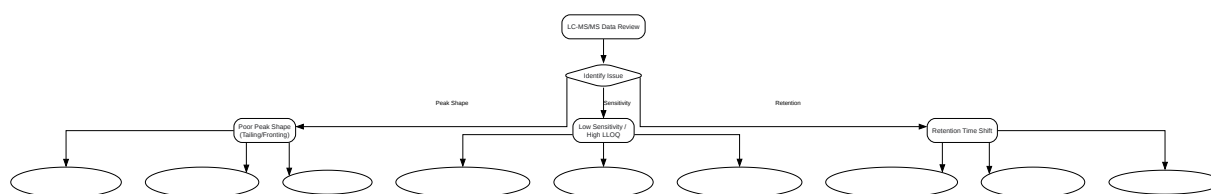
Diagram: LC-MS/MS Troubleshooting Logic

Click to download full resolution via product page