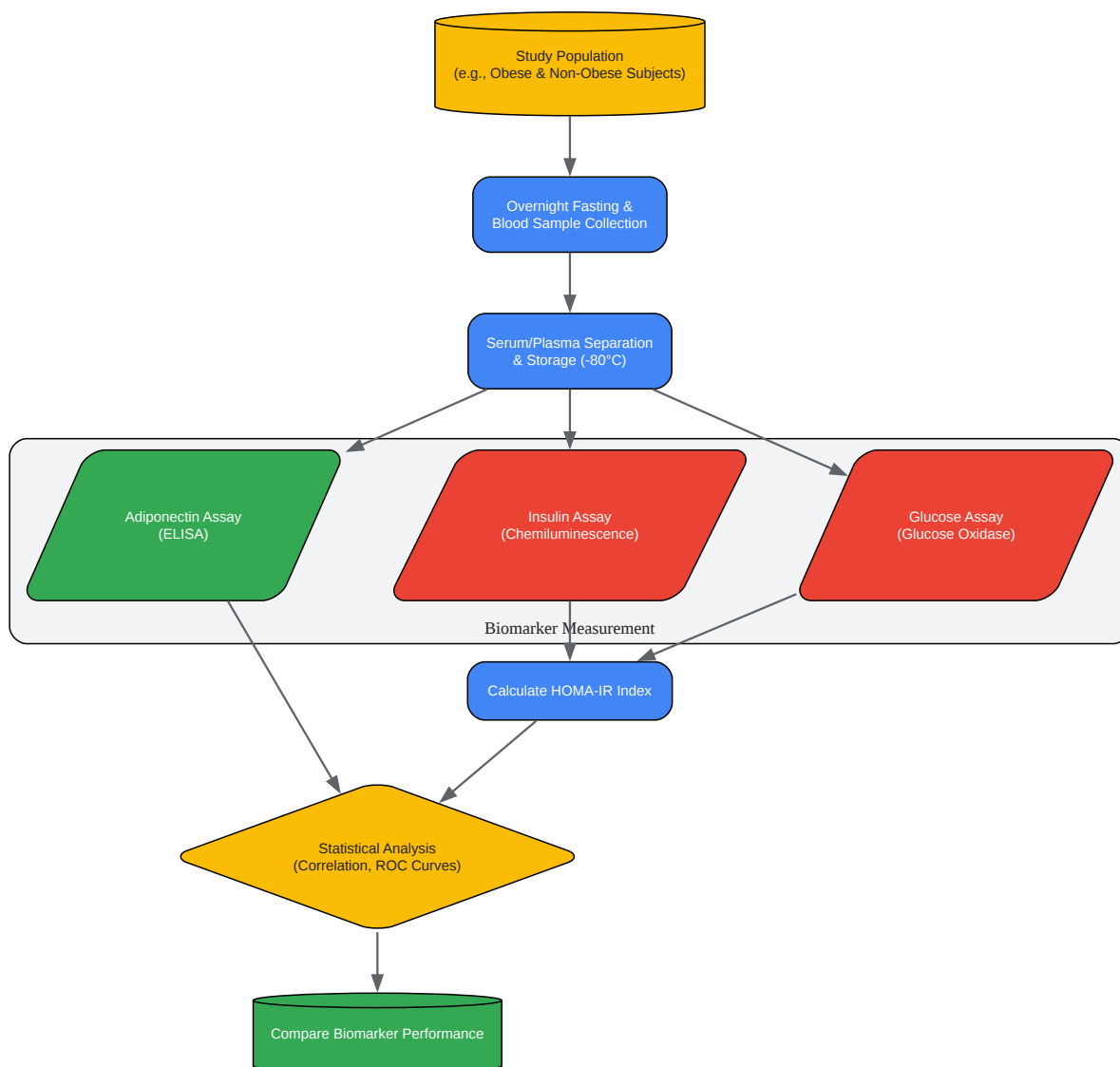
Figure 2: Workflow for Biomarker Validation